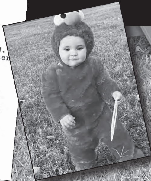
Indian Lake residents enjoyed the 2023 Trunk or Treat event held in the park.